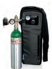
Medium cylinder bag 1065702